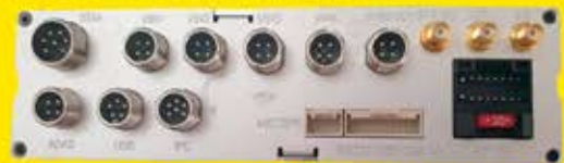
To be connected to the central unit